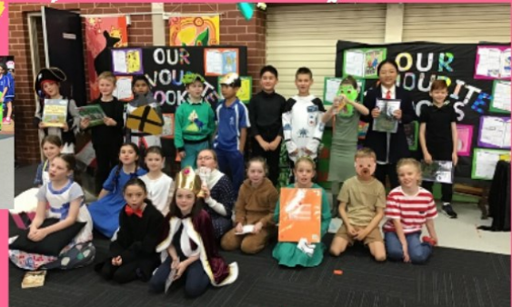
Our Class Assembly