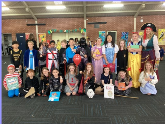
Book Week - Term 3