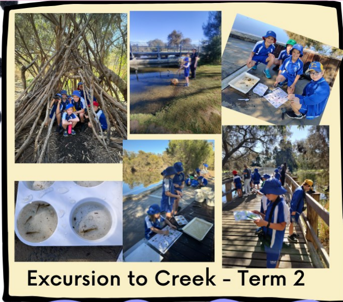
Excursion to Creek - Term 2

What a busy year we have had in Room 11 - Here is just a few highlights!