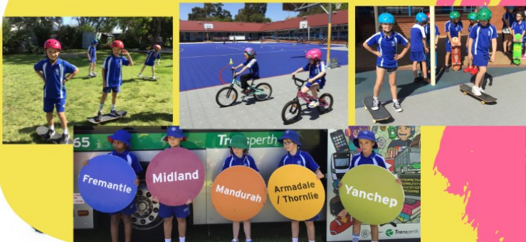
WOW Festival - Term 4