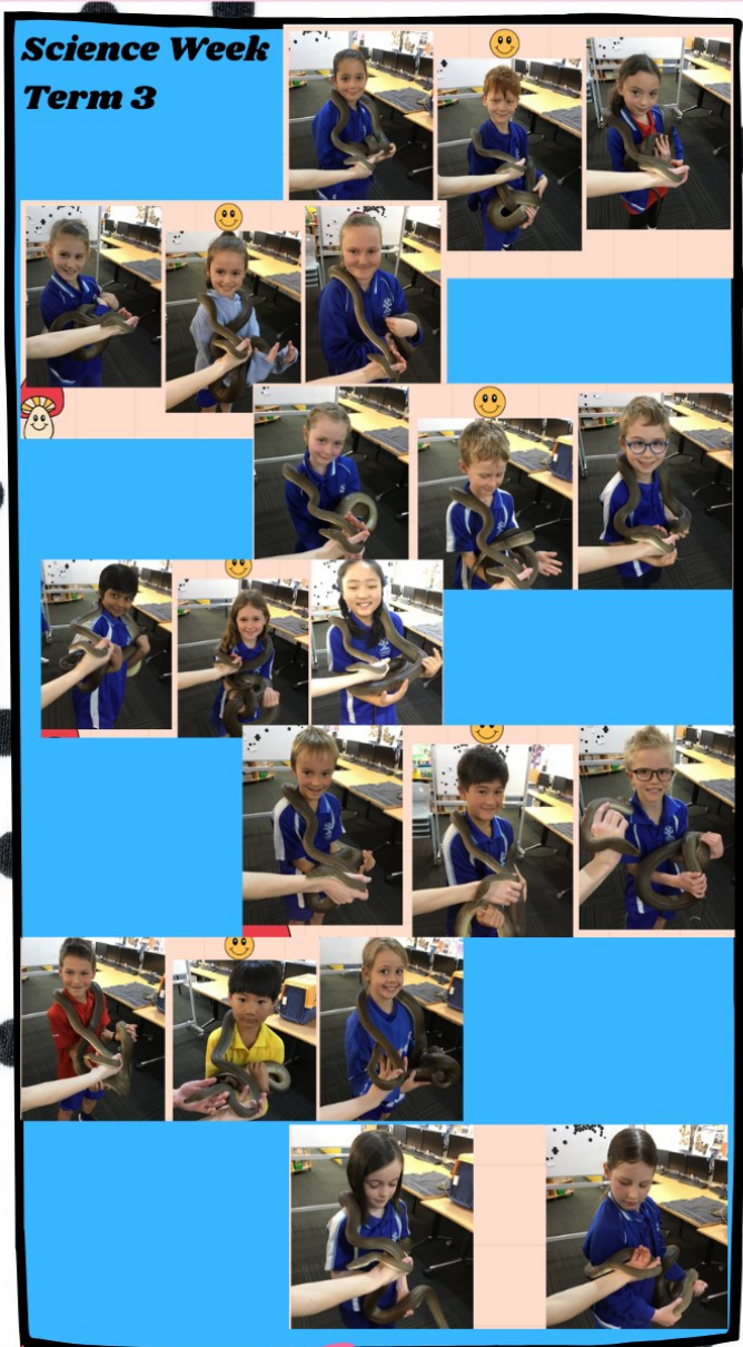
Science Week Term 3