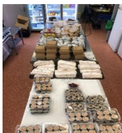
Lunches made, prepped and ready for packing