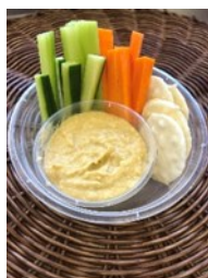
Crackers & Homemade Hummus

The 2023 Canteen Menu can be found on the school website: https://lathlainps.wa.edu.au/parent-info/canteen/