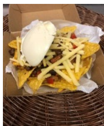
Nachos (Homemade Vegetarian Salsa)